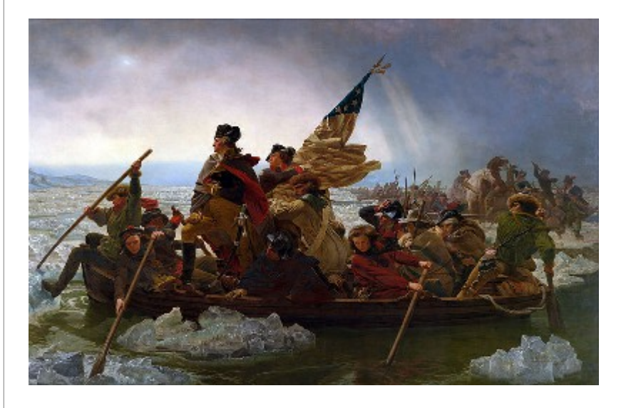
In 1851, Emanuel Leutze painted this picture of Washington and his troops crossing the Delaware River.

It was a major victory for the American Continental Army and it raised their morale.