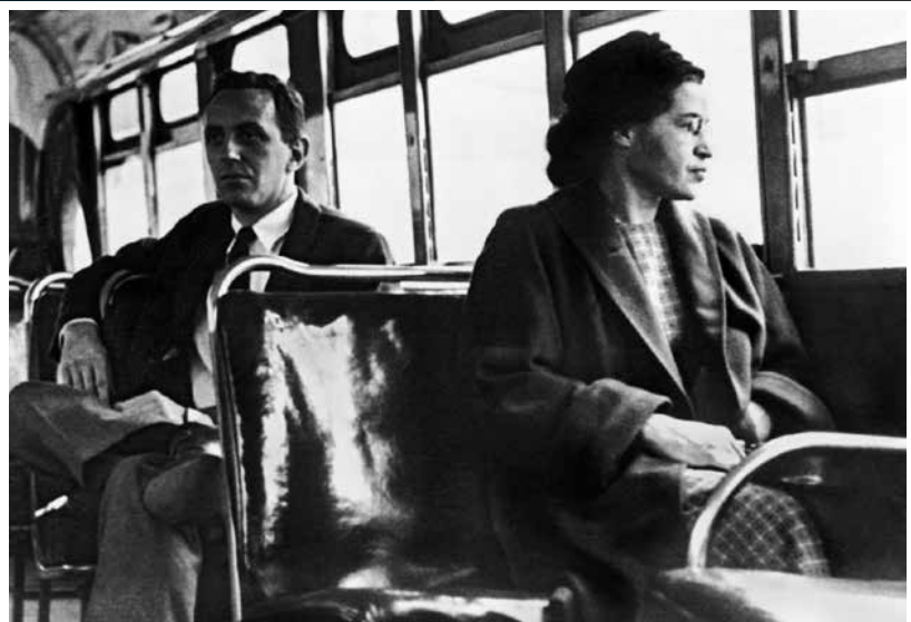
Rosa Parks believed everyone should be treated equally and refused to give up her seat on the bus.

Please log in to download the printable version of this worksheet.