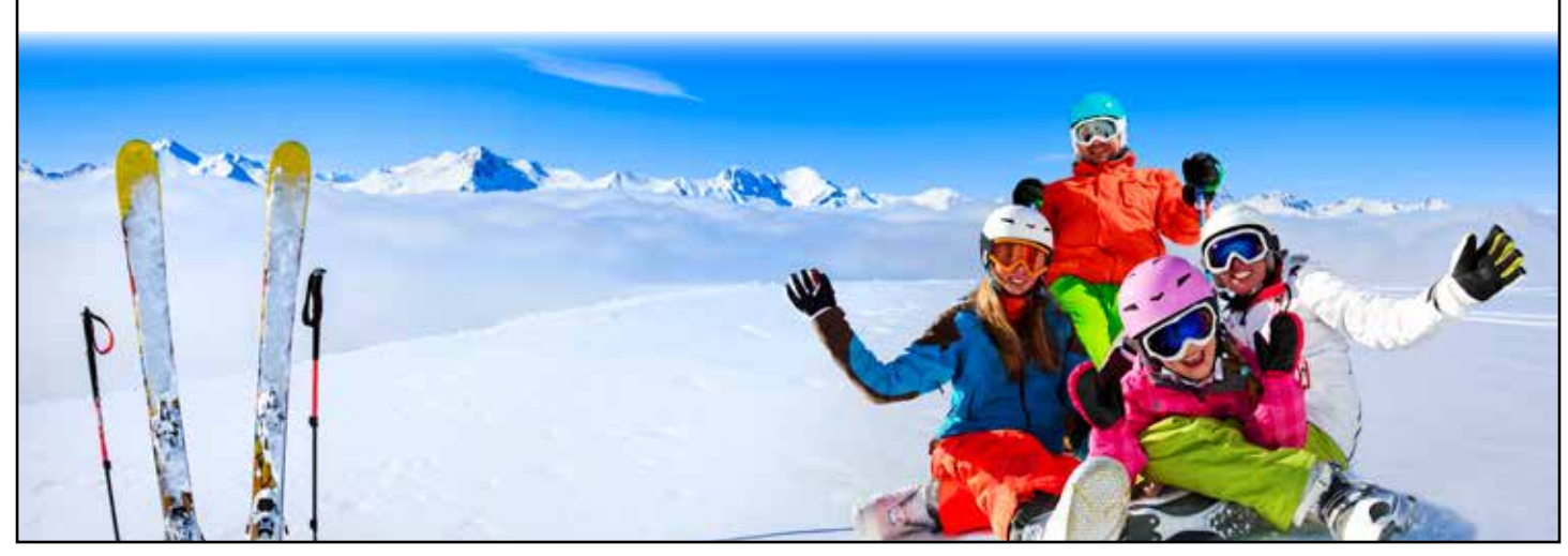
Super Teacher Worksheets - www.superteacherworksheets.com

People who live in these places can enjoy special winter activities like skiing, sledding, or snowboarding. They can also build snowmen and snow castles. When the water in lakes and ponds freeze, people can ice skate or play ice hockey. Some people even cut a hole in the ice and go ice fishing!