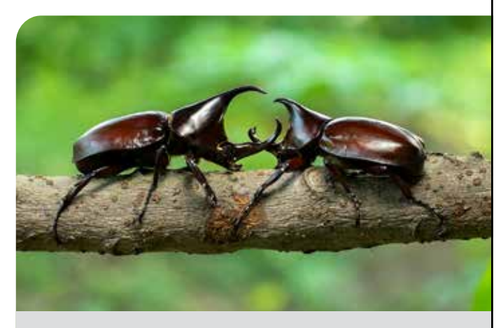
These two male rhinoceros beetles are having a duel.

Rhinoceros beetles live on every continent except Antarctica. Most of the largest species, like the Hercules beetle and the elephant beetle, live in warm, tropical regions. Some smaller