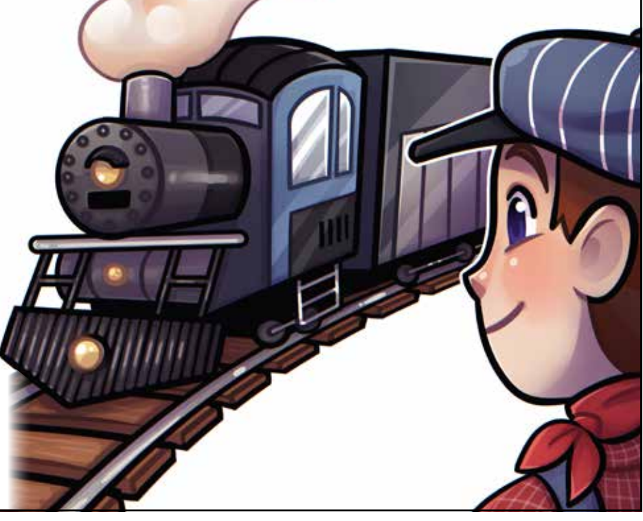
Super Teacher Worksheets - www.superteacherworksheets.com

do their job, and keep the trains going. I am just one worker, but I'm an important piece to the big puzzle that is the railroad.