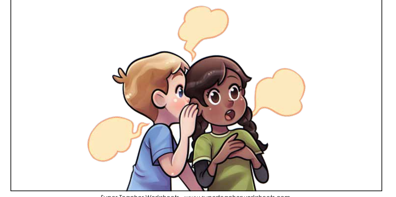
Super Teacher Worksheets - www.superteacherworksheets.com