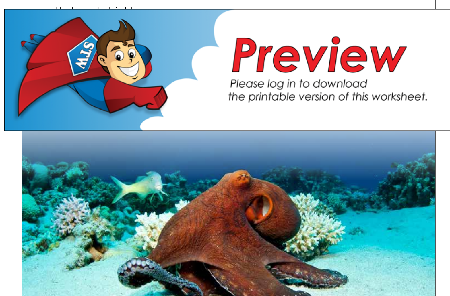
Super Teacher Worksheets - www.superteacherworksheets.com

Unlike most animals, octopuses have the ability to regenerate limbs that are lost. This gives them an advantage because if a limb is lost in battle while defending themselves from predators, it grows back! That's a