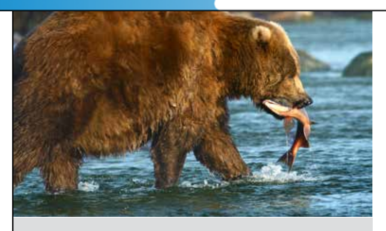
A Kodiak brown bear catches a fish to eat.

Please log in to download the printable version of this worksheet.