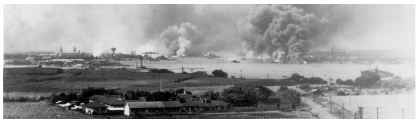
View of Pearl Harbor during Japanese attack

toward the Hawaiian Islands. They waited for orders about 200 miles (320 km) north of the target.