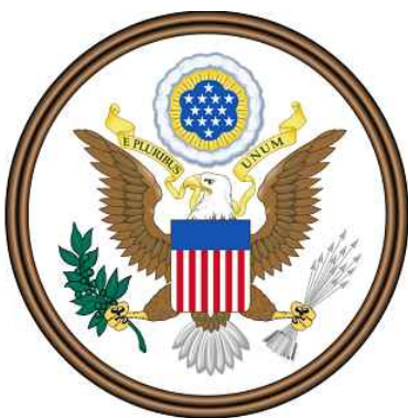
Seal of the United States

the dexter (right) talon of the eagle holding an olive branch, and the sinister (left) talon holding thirteen arrows which represent the original thirteen colonies. Together, the olive branch