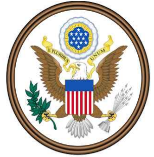
Seal of the United States

In the article, "American Bald Eagle," you learned that the bald eagle is pictured on the national Seal of the United States and it's commonly used as a symbol for America.