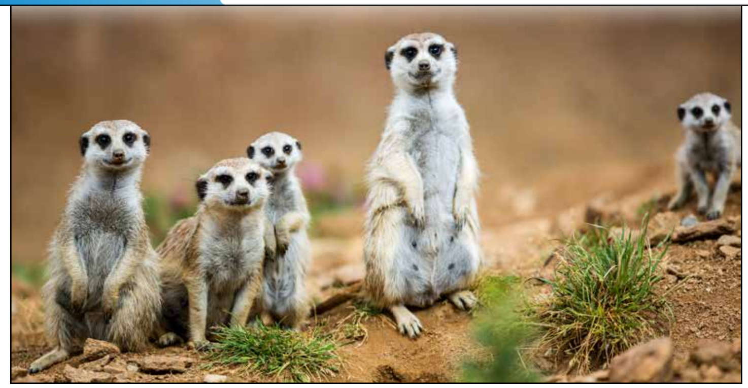
Super Teacher Worksheets - www.superteacherworksheets.com

Please log in to download the printable version of this worksheet.