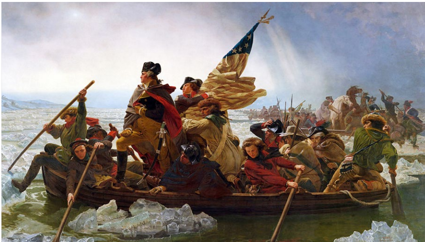
George Washington leading his army across the Delaware River in the Battle of Trenton.

But the new country struggled. It needed a better structure for its government. In 1787, Washington helped head up the Constitutional Convention in Philadelphia. That is where the U.S. Constitution was written to create a brand new form of government.