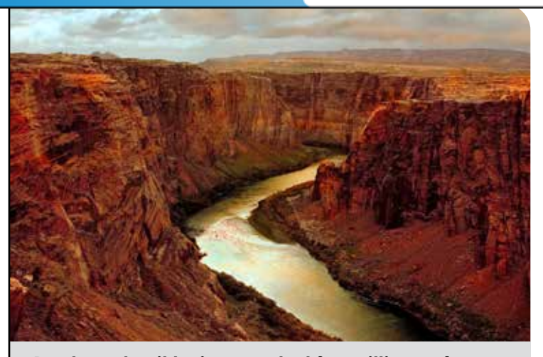
Rock and soil being eroded for millions of years can leave a very deep canyon.

Please log in to download the printable version of this worksheet.