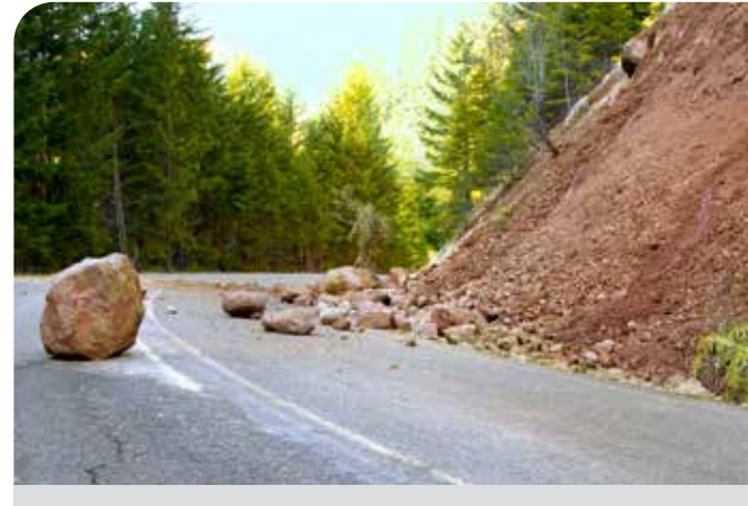
Wind erosion can cause rocks to fall onto roadways below.

But erosion doesn't only make amazing landforms. It can also be dangerous. Sometimes erosion itself is what's dangerous. Mass wasting erosion is not like normal erosion. It is the quick downward movement of rocks, soil, and vegetation (or plants). Deadly snowy avalanches and powerful mudslides are types of mass wasting erosion.