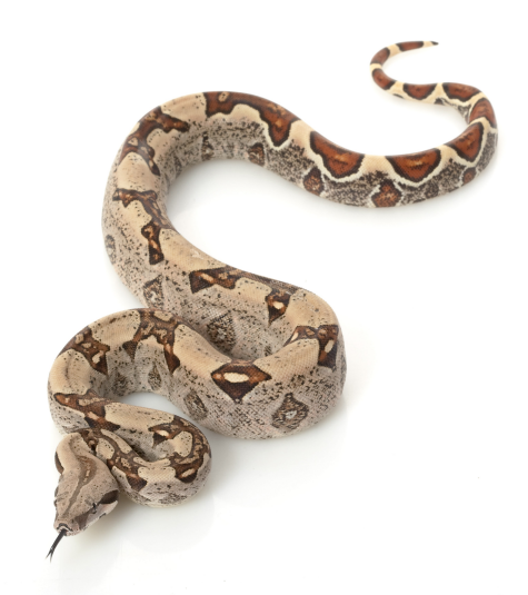
Red-Tailed Boa Constrictor

Both types of snake use their forked tongues to smell. Those that hunt at night can widen the pupils of their eyes to let in more light. They also use heat sensors on their lips to find warm-bodied prey such as rodents.