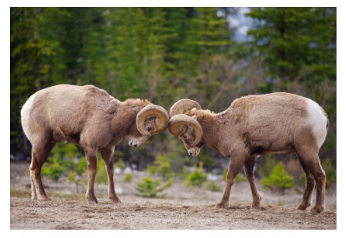
A pair of male bighorn sheep battle by ramming each other in the head.

Where do bighorn sheep live? Bighorn sheep are well-adapted for living in mountain and desert habitats. They can be found mainly in the western half of the United States. They are also in Southwestern Canada and Northwestern Mexico.