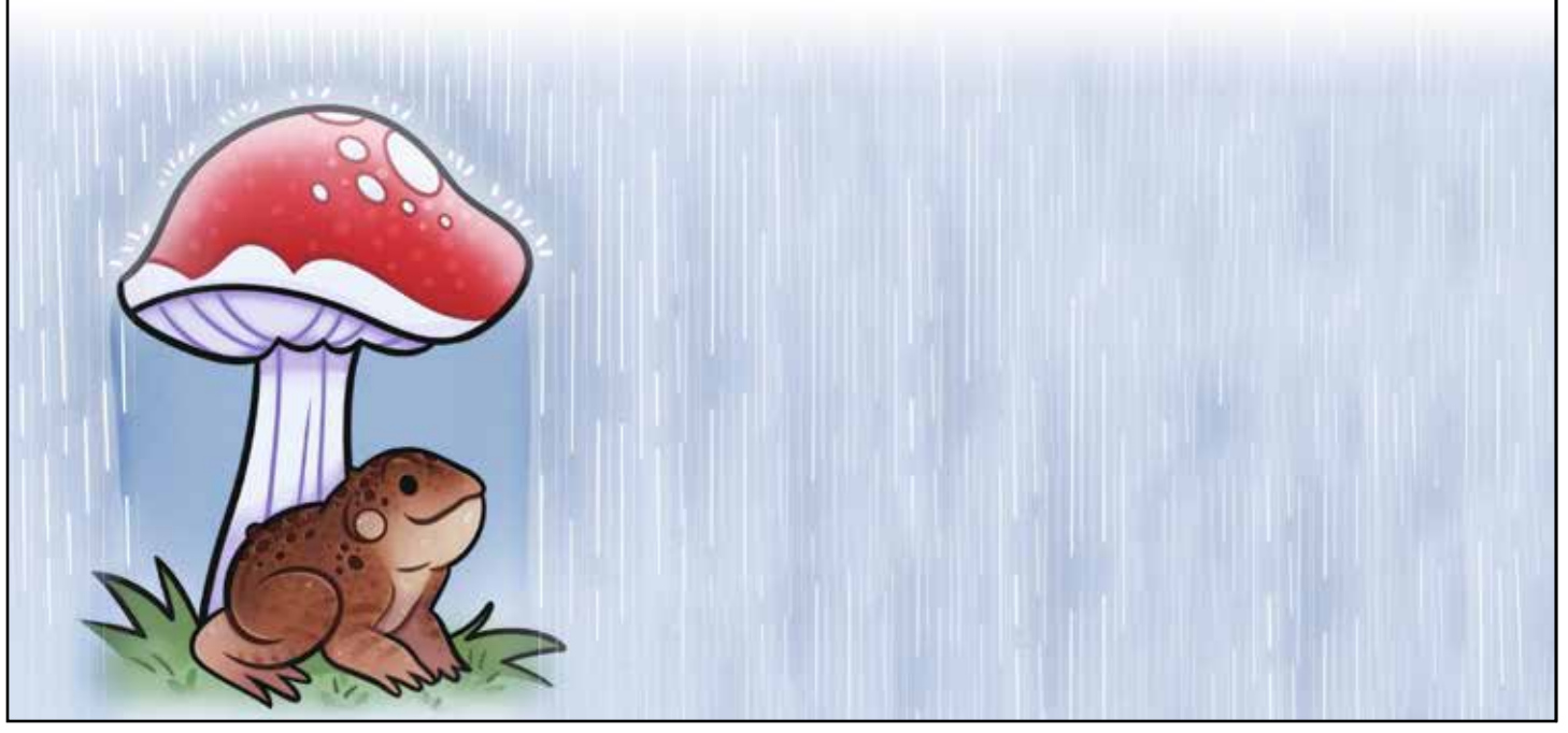
Super Teacher Worksheets - www.superteacherworksheets.com