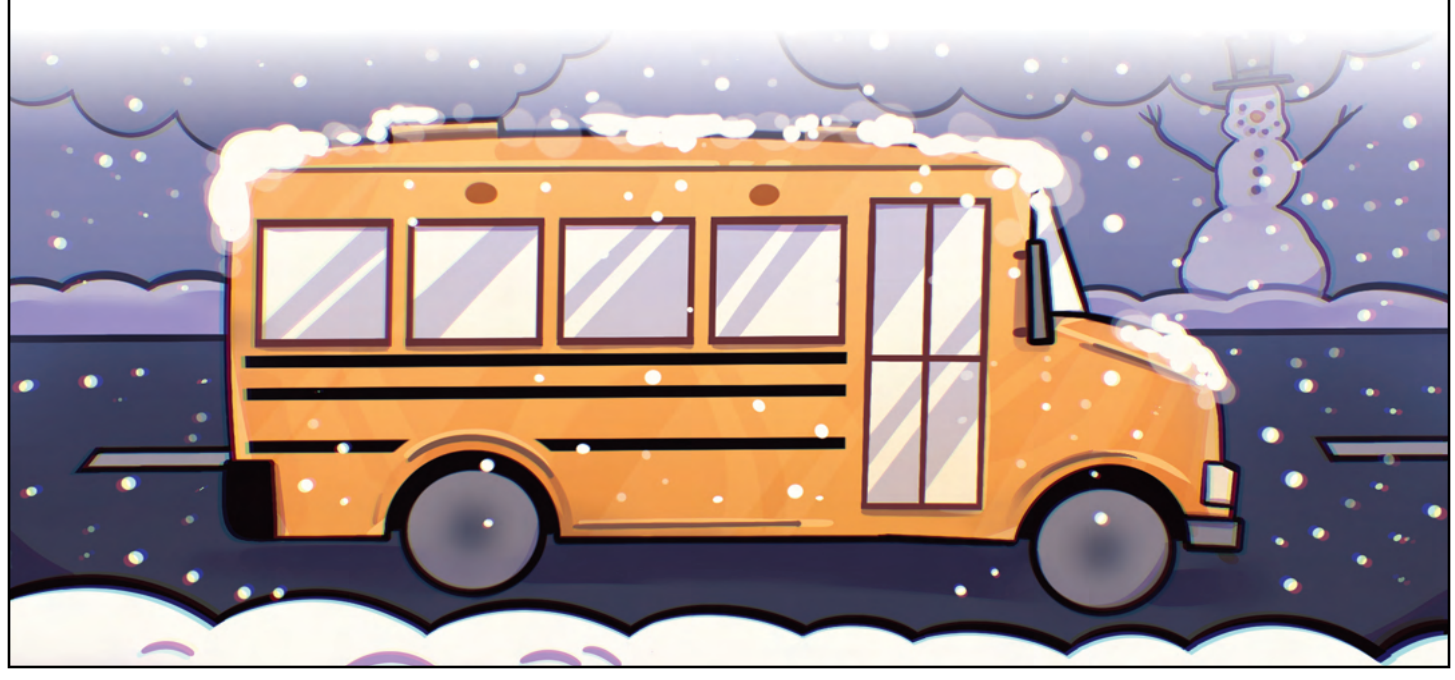
Super Teacher Worksheets - www.superteacherworksheets.com