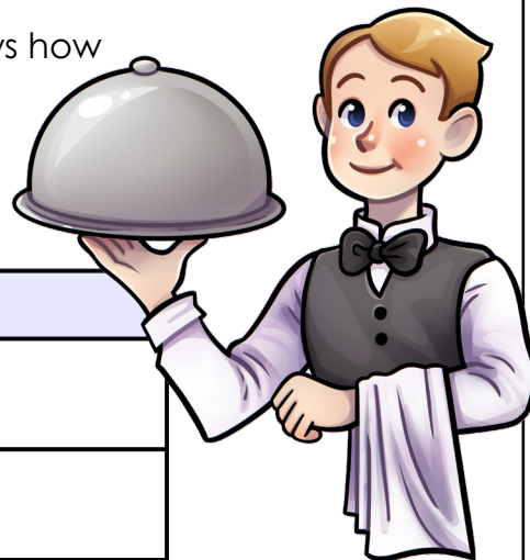
Customers at French's Restaurant

French's Restaurant opened in 2020. The pictograph below shows how many customers they have had each year since they opened.