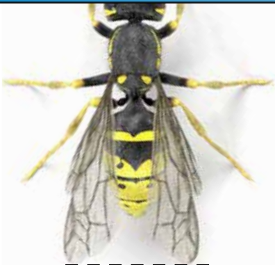
Yellowjacket: 6 cm or 60 mm

Please log in to download the printable version of this worksheet.