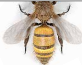
Honeybee: 4 cm or 40mm