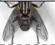
Fly: 3 cm or 30 mm