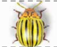
Potato Beetle: 2 cm or 20 mm