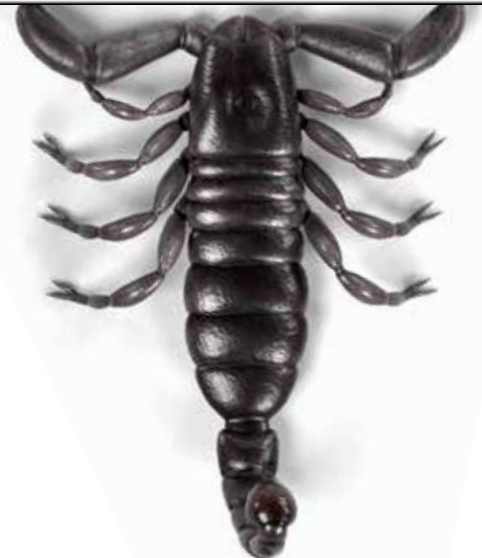
Scorpion: 10 cm or 100 mm