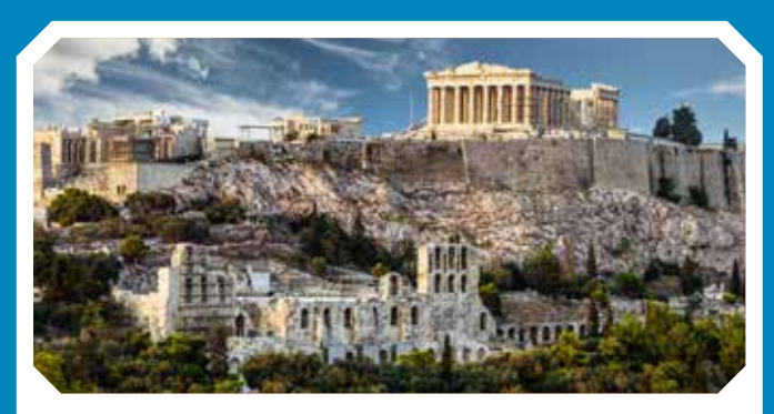
The Roman takeover of Greek