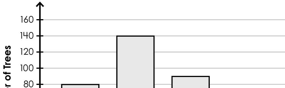
Trees in the Park

An arborist is studying the types of trees in a local park.