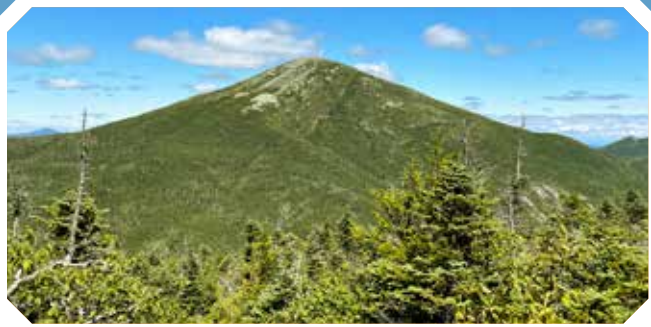
New York's highest point is