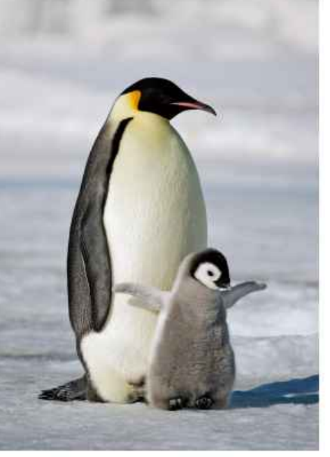
Emperor Penguin with Chick

Super Teacher Worksheets - <u>www.superteacherworksheets.com</u>