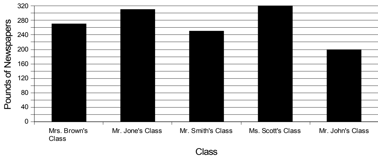
Pounds of Newspapers Recycled by Abraham Lincoln Elementary School Students