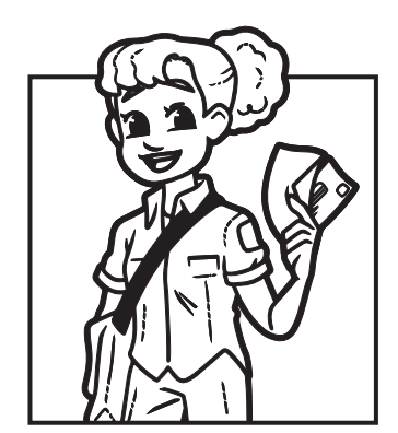
Staple or glue