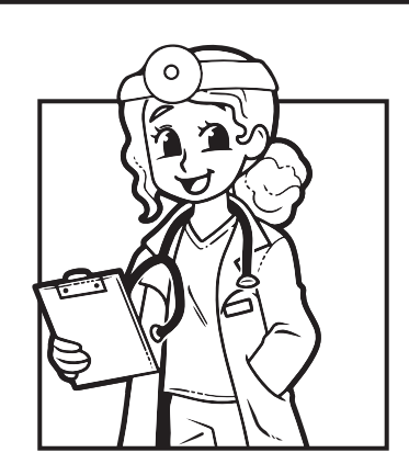
Staple or glue