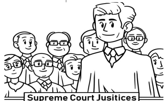
Supreme Court Justices