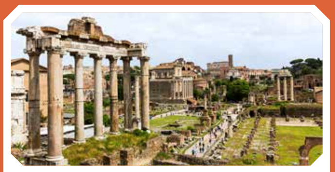
The Roman Forum was at the