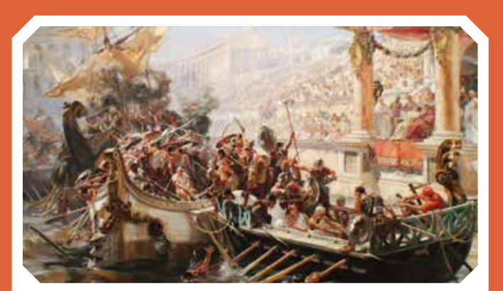
Romans loved a naumachia